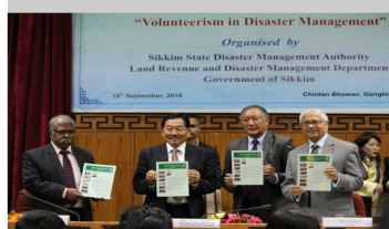
State Disaster Risk Reduction Day with the theme "Volunteerism in Disaster Management"