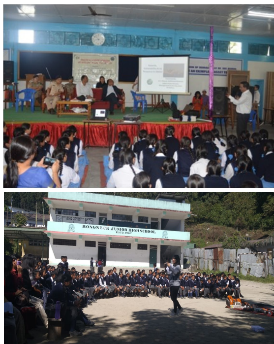
Disaster management exhibition cum mock drill

Under the AMRUT City mission, disaster management exhibition and mock drill are being conducted in various schools in Gangtok AMRUT city. SSDMA along with State Disaster Response Force, Fire and Emergency Services and Human Resource and Development Department conducted the exhibition and mock drill at Tadong Sr. Sec. School on 25 th Oct, Rongneck Junior High School on 29 th Oct and Lumsey Junior High School on 30 th Oct 2018.