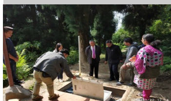
Landslide Early Warning System (EWS) installed at Chandmari, Gangtok.