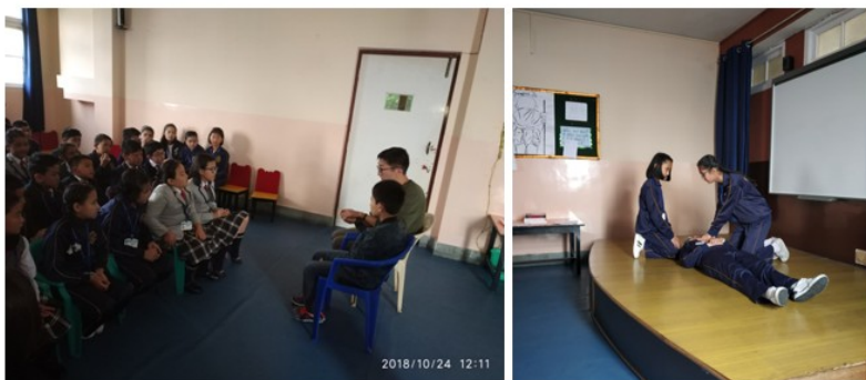
Disaster Management Training

SSDMA conducted a one day awareness programme on Disaster Management and Evacuation drill at Little Pixies International School, Gangtok on 24th October, 2018.