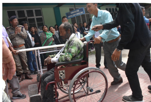
State Level Mock Exercise, Namchi