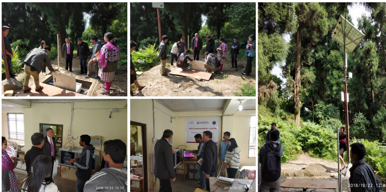
Landslide early warning system (EWS) installed at Chandmari

Sikkim State Disaster Management Authority (SSDMA) in collaboration with AMRITA Vishwa Vidyapeetham, South India has installed a real-time landslide early warning system at Chandmari, Gangtok East Sikkim. The system collects real-time, continuous data from the sensors, perform basic analysis at the Field Management Center (FMC) located on the site in Chandmari, Sikkim and relay it to the Data Management Center (DMC) at the University, Kerala where detailed analysis is done and threshold situation is identified for disseminating warnings.