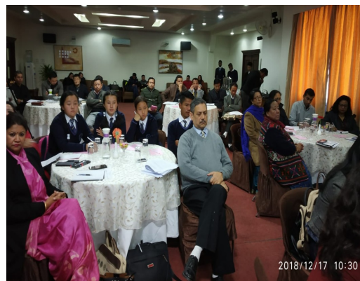
State level consultation at Gangtok

A State level Consultation on Child Centered Disaster Risk Reduction into School Curriculum was organized by SDMA, NDMA, UNICEF and Oxfam India on 17th December 2018 at Gangtok. State Council of Educational Research & Training (SCERT), Human Resource Development Department (HRDD) and schools participated in the programme. The Consultation aimed to integrate Child Centered disaster elements, exposure and capacities into the existing school curriculum.