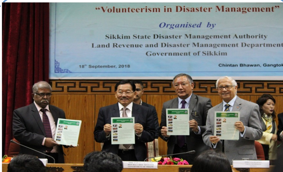
State Disaster Risk Reduction Day, 2018