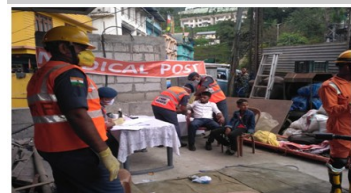
State level earthquake mock exercise conducted in Sikkim