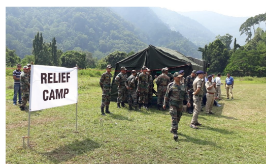
State Level Mock Exercise, Rangpo