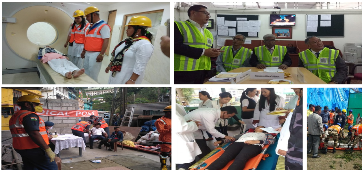
State Level Mock Exercise, Gangtok

STNM Hospital and CRH Manipal provided medical services. Staging Area and Relief Camp were set up at Paljor Stadium.