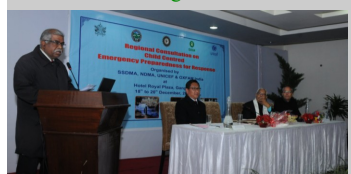
Regional consultation on child centered emergency preparedness and response planning