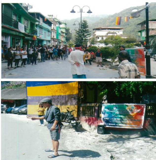
Street Play along the downstream areas

Under the SDC-UNDP project on 'Strengthening State Strategy for Climate Change Action', SSDMA along with various line departments and stakeholders has been carrying out mitigation measures in the South Lhonak Glacial Lake. SSDMA has also been sensitizing the communities on GLOF and its preparedness through street plays in the downstream areas along the river belt.