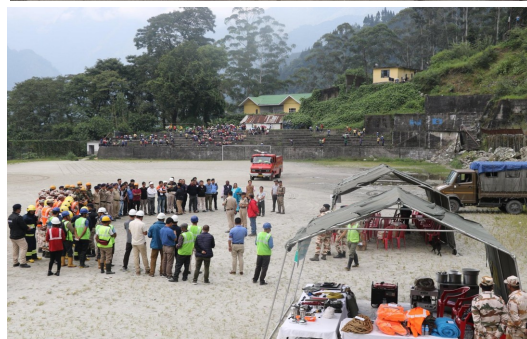
State Level Mock Exercise, Mangan