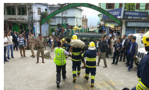
State Level Mock Exercise, Gyalshing