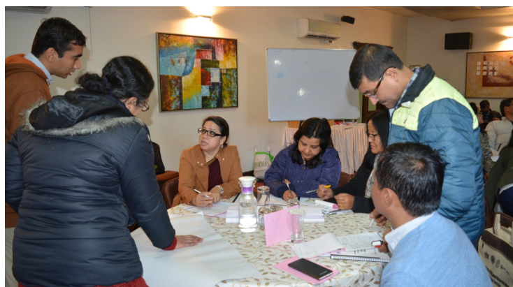
Regional consultation at Gangtok

LANDSLIDES OCCUR WITHOUT WARNING, BE PREPARED PROTECT YOURSELF