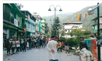
Street play for awareness on Glacial Lake Outburst Flood (GLOF)